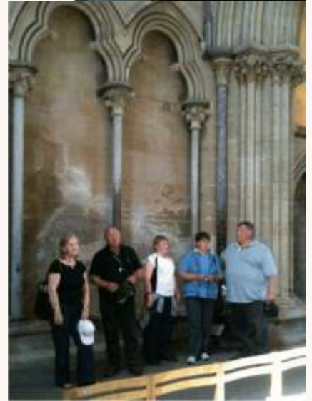
Our stop off at Wells to visit the Cathedral